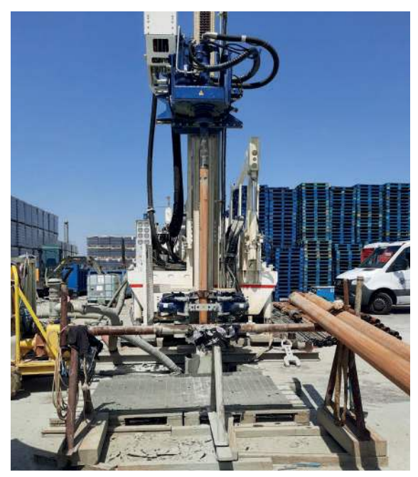
On this Mi12, the Massenza technical team used a hydraulically driven device by means of a gear motor and chain with high pull and maximum thrust of 150kN

The Mi12, set up to work with direct circulation both with mud and air, represents truly remarkable performance for a rig of this size